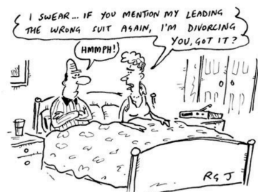
THE MORNING AFTER THE BRIDGE NIGHT BEFORE